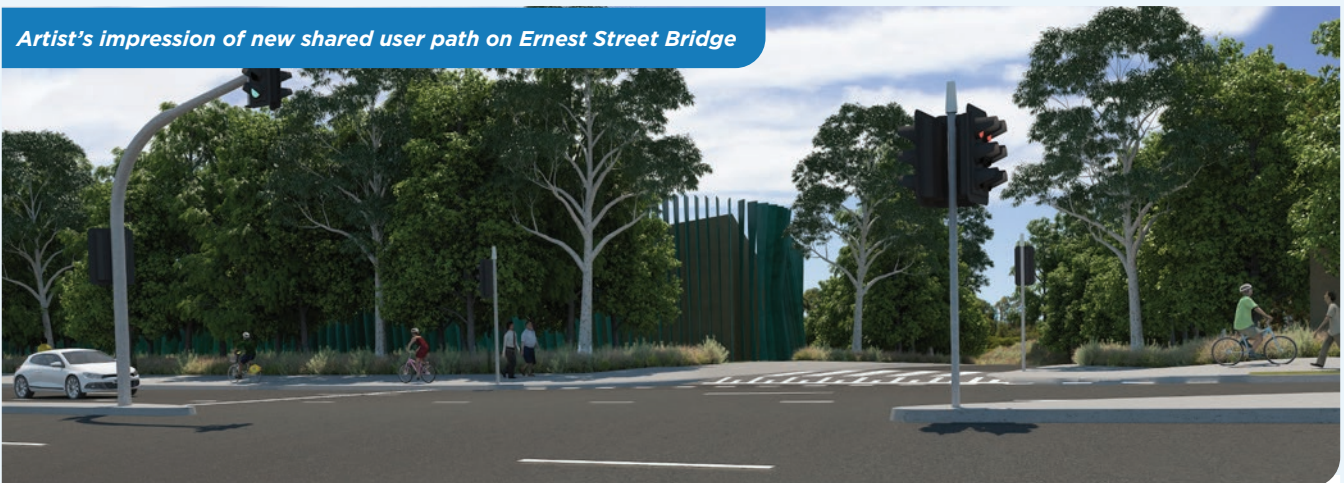
Artist's impression of new shared user path on Ernest Street Bridge

We will be inviting you to take part in a range of opportunities to provide input and feedback on the urban design and landscaping as the project progresses.