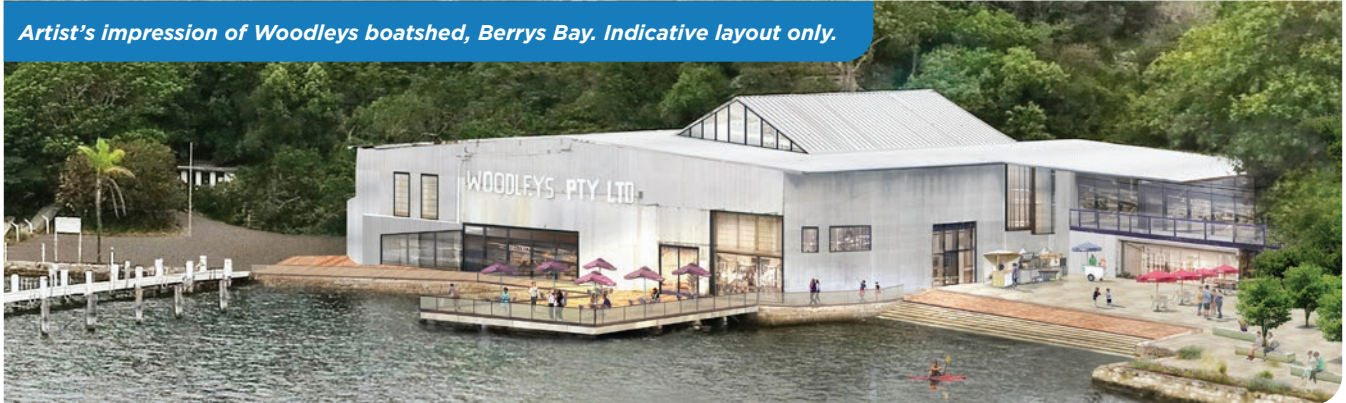
Artist's impression of Woodleys boatshed, Berrys Bay. Indicative layout only.